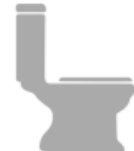
Sharing Toilets, Food, or Drinks