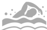
Air or Water