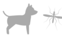
Insects or Pets